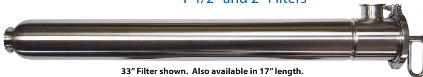
33" Filter shown. Also available in 17" length.